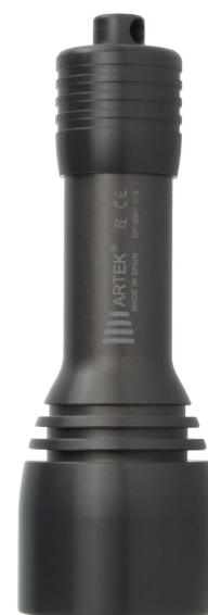
Dolphin mk2 Side view

In addition, unit has its own unique serial number that identifies it.